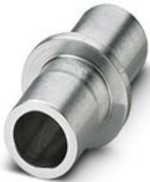
Aluminum adapter, to fix the P-PEN during plotter marking

Please be informed that the data shown in this PDF Document is generated from our Online Catalog. Please find the complete data in the user's documentation. Our General Terms of Use for Downloads are valid ( http://phoenixcontact.com/download )